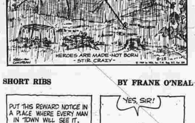
BY FRANK O'NEAL