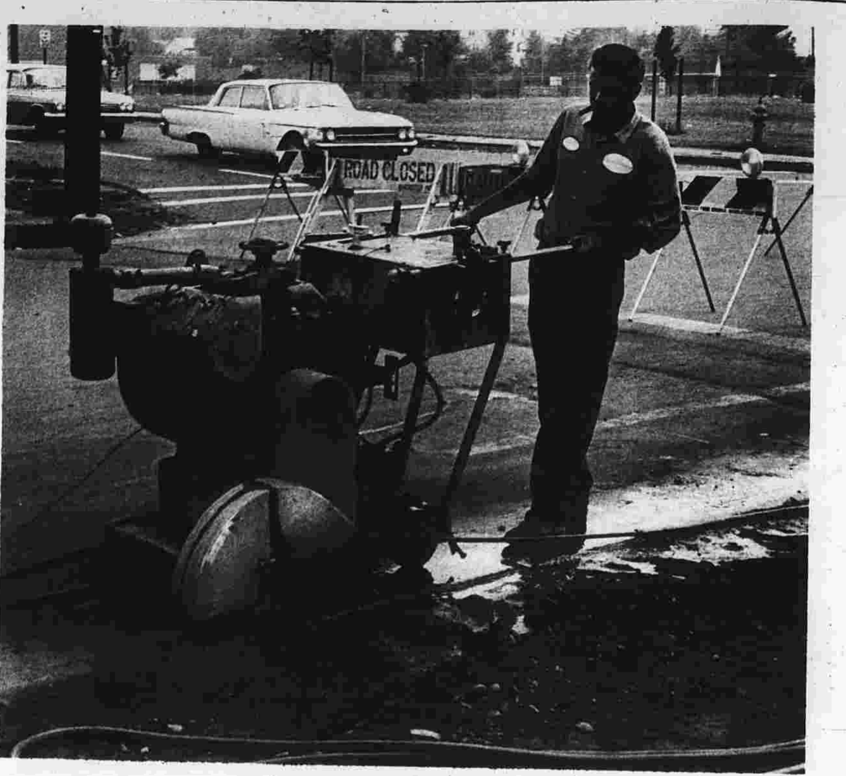
SAWING CONCRETE.

And one network suggests that if Congress is really so convinced about the cigar peril it should proceed to ban the manufacturer, rather than just the television advertising, of the cigar.