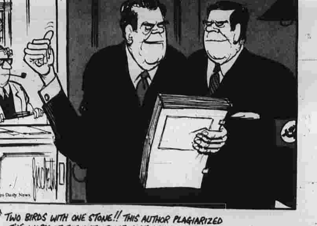
Two birds with one stone!! This author plagiarized the work of the author we just sent to prison!