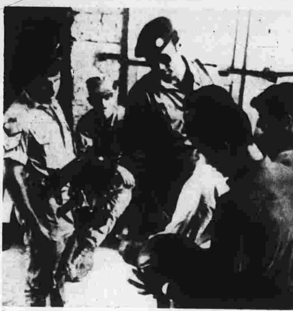
Israeli soldiers check Arabs carrying watermelons for possible bombs Sunday as the Arabs enter gate to the Al Aksah mosque in Jerusalem. The mosque was partially burned Thursday, causing protest throughout the Arab world.

By THE ASSOCIATED PRESS Arab foreign ministers gathered in Cairo today as calls for a holy war against Israel mounted. Brought together by the fire in the Al Aksah Mosque in Jerusalem, the ministers were expected to discuss Jordan's proposal for a summit meeting. And a summit meeting could result in the Arabs abandoning all efforts toward a peaceful settlement with Israel.