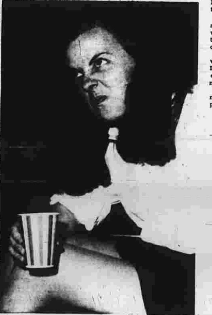
Bernadette Devlin, civil rights champion from Northern Ireland, makes a face when asked Saturday in New York City what she thought about possibility of two Unionist members of British Parliament coming to United States to counter her financial appeal and arguments. "I'll debate them in Carnegie Hall, she snapped, "and still knock hell out of them." (AP Photofax)

SAIGON (AP) — U.S. Air Force transport planes have flown 18 armored personnel carriers and six anti-aircraft guns to the Bu Dop Special Forces camp 80 miles north of Saigon following intelligence reports that enemy armored columns were heard moving along the Cambodian border.